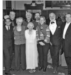
The Albany Club, Reception

When we talk about our Annual Concert, we usually focus on the financial contribution and indeed, those contributions, which this year totalled some $90,000, are essential to maintaining the level of support we provide to our clients, and to allowing LOFT to reach out to those who fall through the cracks in the social safety net. But there is more going on than meets the eye.