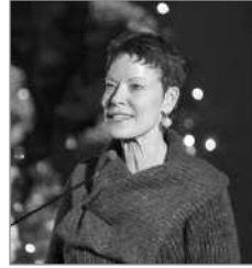
Karen Kain, Honorary Patron